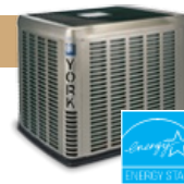
CZF Air Conditioner