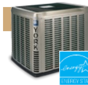
CZH Air Conditioner

Affinity™ Series split system air conditioners are available in ENERGY STAR® qualified models that offer at least 15% to 25% higher energy efficiency than standard models—and come with the innovative QuietDrive™ Comfort System for very silent operation. Learn more about Affinity™ air conditioners.