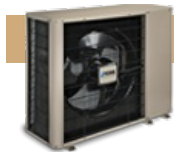
TCHD Air Conditioner