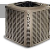
YCJD Air Conditioner