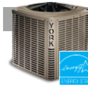
YCJF Air Conditioner

LX Series split system air conditioners fit your needs with select ENERGY STAR® models that reduce your utility bills and MicroChannel Coil technology that provides more cooling in a smaller footprint. Learn more about LX air conditioners.