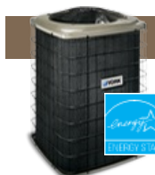
TCGF Air Conditioner

Count on the high efficiency Latitude™ Series with ENERGY STAR® models to reduce your utility bills. Plus, the small footprint of MicroChannel Coil technology will give you more space around your place. Learn more about Latitude™ air conditioners.